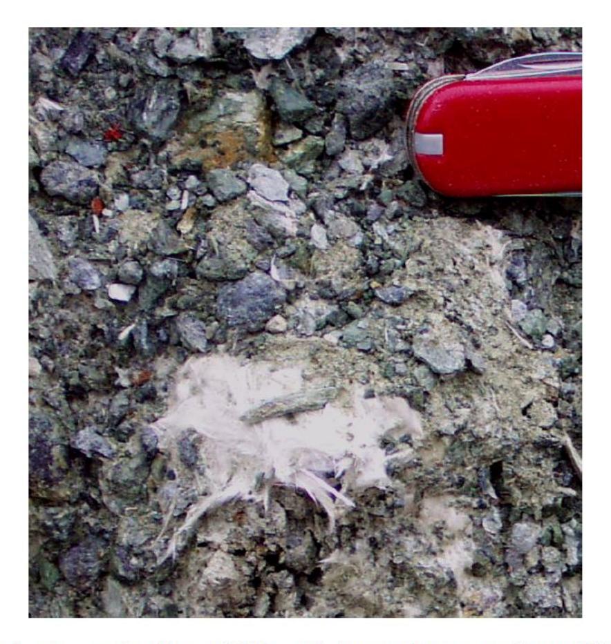
Figure 4. Chrysotile asbestos south of Foresthill Road between Auburn and Foresthill.

Please see the following photographic examples of Naturally Occurring Asbestos (credit to the California Geologic Survey's report titled, "RELATIVE LIKELIHOOD FOR THE PRESENCE OF NATURALLY OCCURRING ASBESTOS IN PLACER COUNTY, CALIFORNIA.")