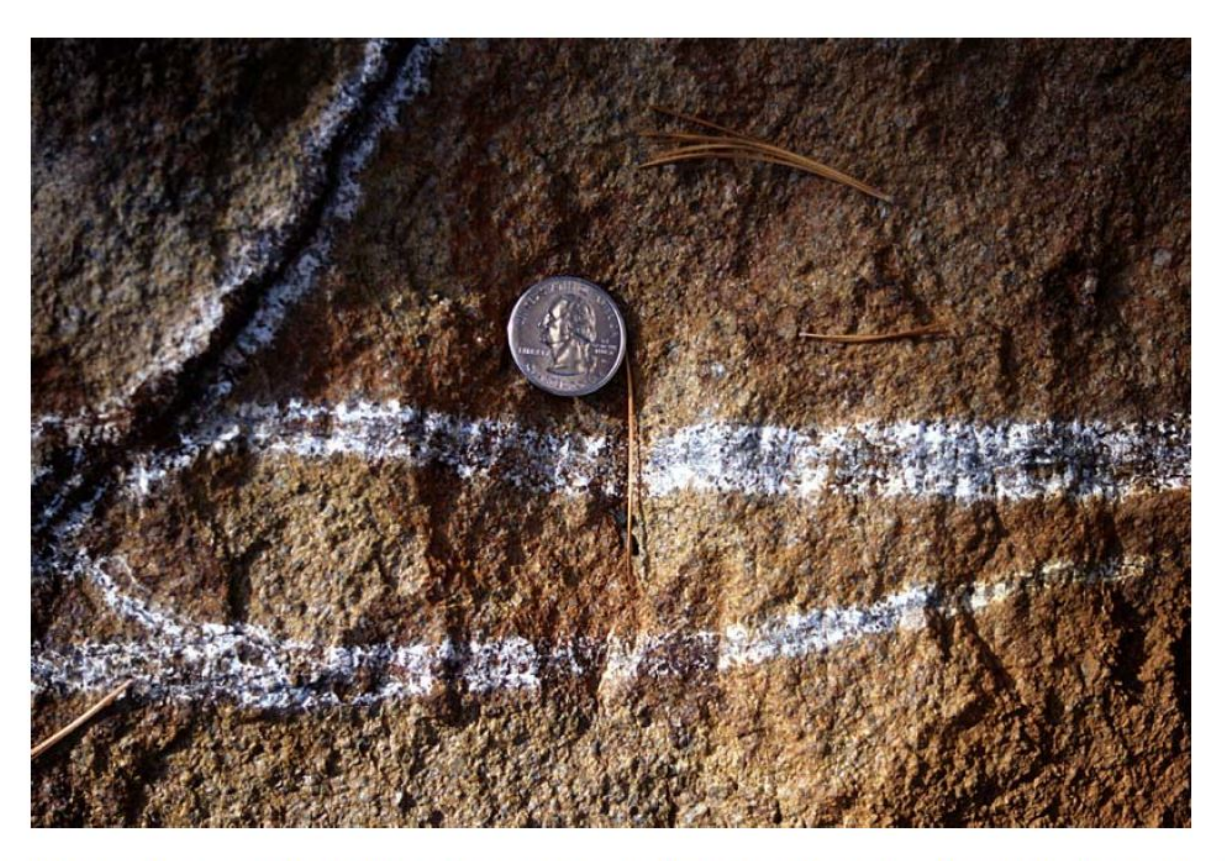
Figure 3. Veins of serpentinite in ultramafic rock from the Emigrant Gap area. Small bands of chrysotile are present within the veins.